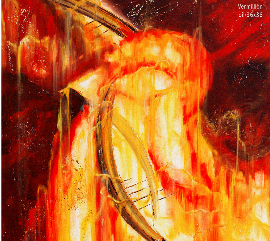
Vermillion oil 36x36